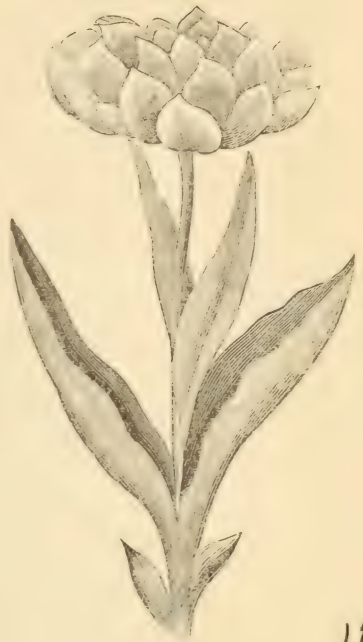
DOUBLE TULIP, DUC VAN THOLL.